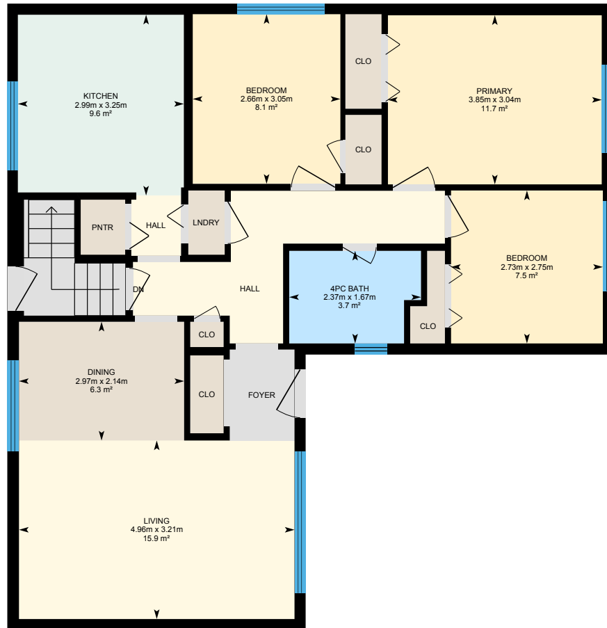
Main Floor Exterior Area 95.12 m 2

Main Building: Total Exterior Area Above Grade 95.12 m 2